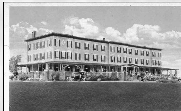
HOTEL BRADDOCK, BRADDOCK HEIGHTS, MD.